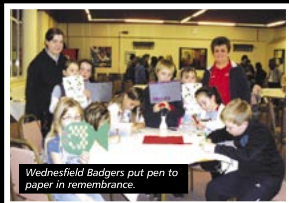
Wednesfield Badgers put pen to paper in remembrance.

Once again, in addition to our ceremonial role, St John Ambulance also provided medical cover with a crewed ambulance and three first aid teams. Afterwards, the Cathedral remained open and a number of reflections in the form of poetry, readings and singing were performed. Cover was continued throughout the evening until the cathedral closed.