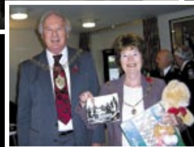
The Lord and Lady Mayoress of Coventry –the Lady Mayoress is holding a photo of herself as a Cadet