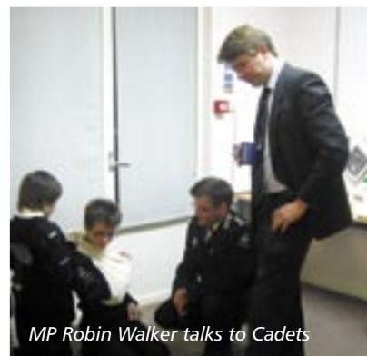
MP Robin Walker talks to Cadets