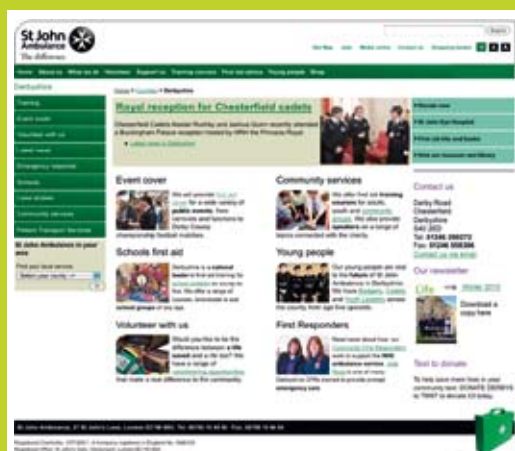
ABOVE: The new Derbyshire SJA website see www.sja.org.uk/counties/derbyshire

There are sections on everything from youth groups and schools to volunteering and Community First Responders.