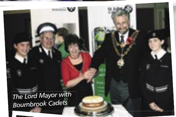
The Lord Mayor with Bournbrook Cadets