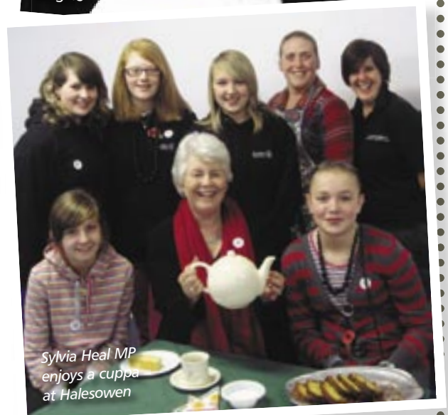
Sylvia Heal MP enjoys a cuppa at Halesowen