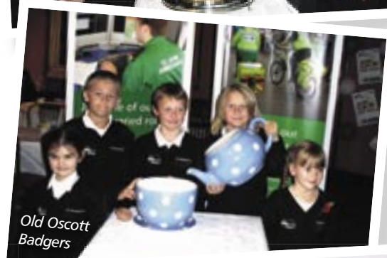
Old Oscott Badgers