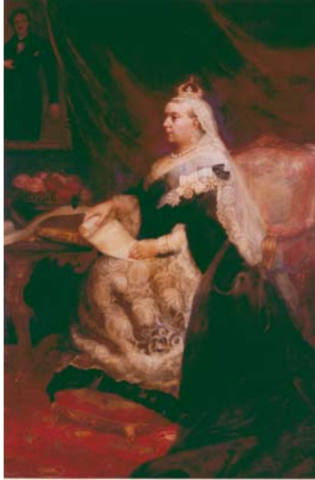
HM Queen Victoria holding the Order's Royal Charter

In the nineteenth century, around 400 years after Henry VIII had taken all the property of the medieval Order in England, there were moves to revive the Order. In 1888 HM Queen Victoria granted the Order a Royal Charter "in recognition of the excellent work performed by members of the Order of St. John during the past half century, especially the establishment of the St. John Ambulance Association." Since then, the reigning Monarch has always been the Sovereign Head of the Order. HRH Richard, Duke of Gloucester, is the current Grand Prior.