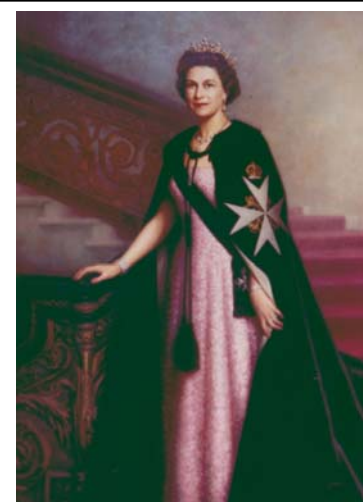
HM The Queen, who is the Sovereign Head of the Order, in ceremonial dress

On St. John's Day in 1888, the year the Order was granted its Royal Charter, Edward Prince of Wales became the President of the Association. At the unveiling of a memorial to the Duke of Clarence at