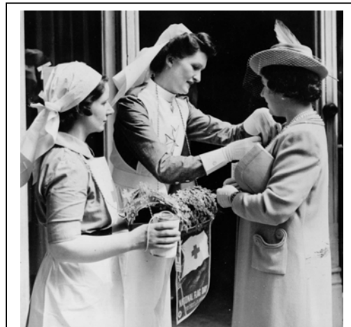
The Queen Mother with two VAD nurses during World War 2

St. John's Gate, the Prince of Wales said of the St. John men standing by: "This is a good uniform. I believe much good will come of it."